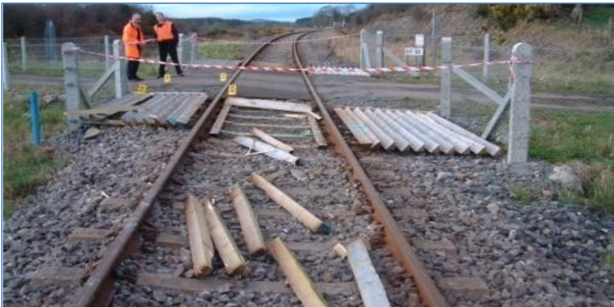
Photo 1 - Damage to infrastructure

There was only minor damage to the infrastructure, damage was caused to the cattle grids at the crossing and a railing on the railway bridge was dislodged when struck by the car (Photo 1 – Damage to infrastructure).